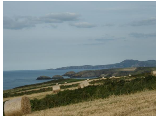
Arfordir gwych Sir Benfro The beautiful Pembrokeshire coastline