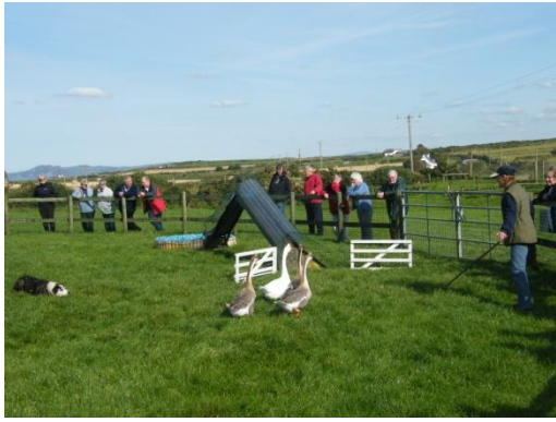
Rhoi'r gwyddau yn eu lle. Putting the geese through their paces.