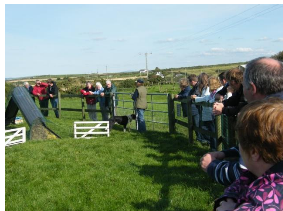
Aelodau yn mwynhau'r arddangosfa. Members enjoying the exhibition.

More photos overleaf. AGM minutes now available.