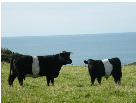
Rhai o wartheg Tremynydd. Tremynydd cow and calf.

Ceir mwy o luniau drosodd a cheir cofnodion ar ffeil i'w dosbarthu.