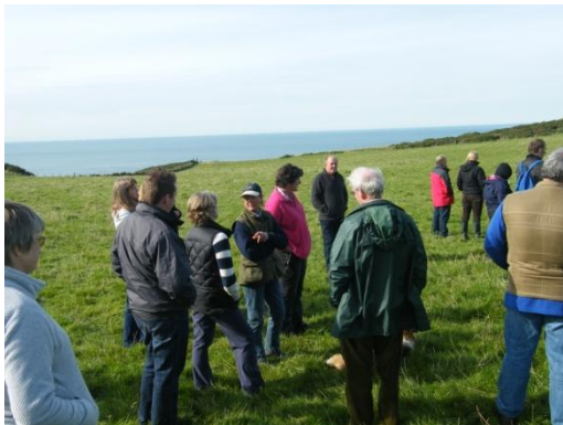
Aelodau yn edrych ar y gwartheg Members viewing cattle